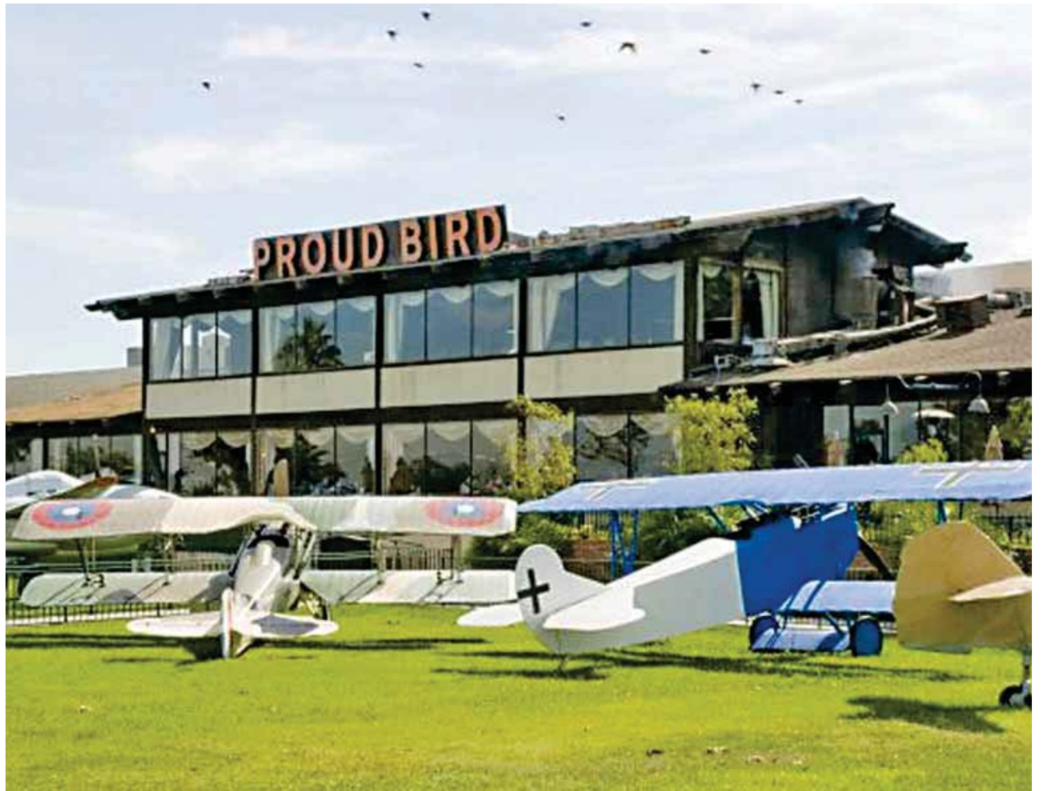
On Dec. 22, the infamous Proud Bird Restaurant will retire. A historic restaurant, which has served Los Angeles County residents for 47 years, will be remembered by its landmark symbol "the airplane," the restaurant's pivotal attraction. On Dec. 14, in honor of its retirement, the United Economic Development Fund will present a commemorative plaque to Proud Bird for its outstanding services to Los Angeles County.